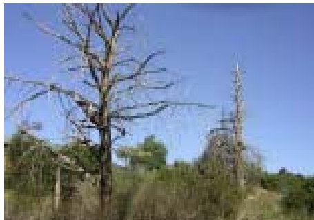
Dead cypress trees mark the old Bovet adobe site.

The pueblo land of Soledad valley was initially meant to be used by the